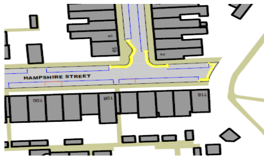
Plan of existing and proposed restrictions

vehicles parking across the eastern end and against the north and south kerbs because the vehicles on the north and south kerbs could become trapped by other vehicles parking in the bays along those kerbs. However, it is recommended to extend the bays on the north and south sides to meet the eastern kerb but to retain the double yellow across the remaining width of the carriageway.