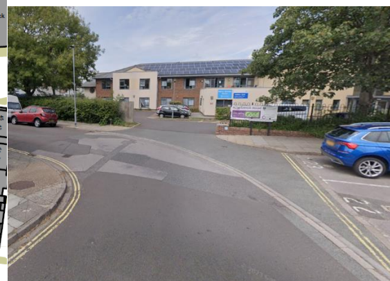
View from Fourth St looking north towards The Harry Sotnick Centre