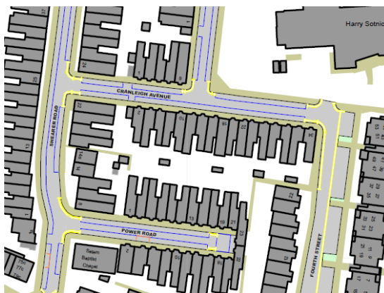
Plan of existing and proposed restrictions

Representation 106 refers to additional yellow lines in Cranleigh Avenue and adjacent road. The representation suggests that six parking bays will be lost by the proposal. The plan below shows what the area would look like if the proposal is introduced. The only new yellow lines in Cranleigh Avenue detailed in the Public Notice "Cranleigh Ave – north side, 4m west and 3m east of the entrance to Harry Sotnick House" and are intended to ensure there is clear sight lines around the access and it is not recommended to change this. However the representation also suggests that the garage beside No1 Cranleigh Avenue is not in use and a parking space could go over it. The officers will investigate this and if the garage cannot be used an extension of the bay will be proposed.